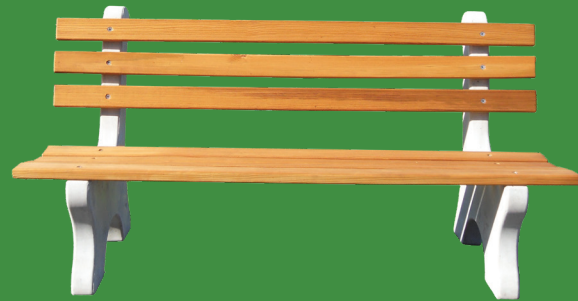
72" Long Wooden Bench with Concrete Legs