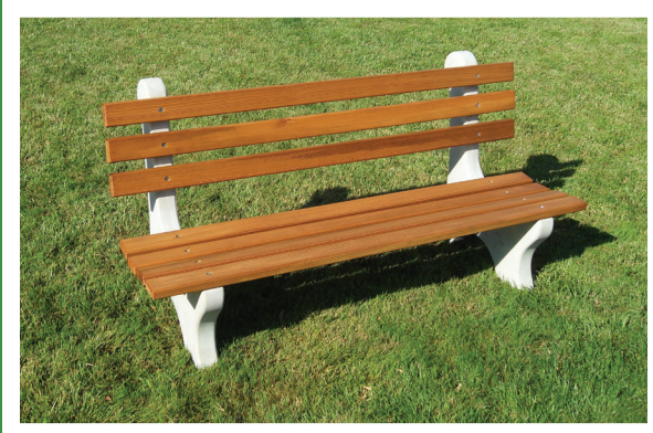
Shown with natural cedar stain