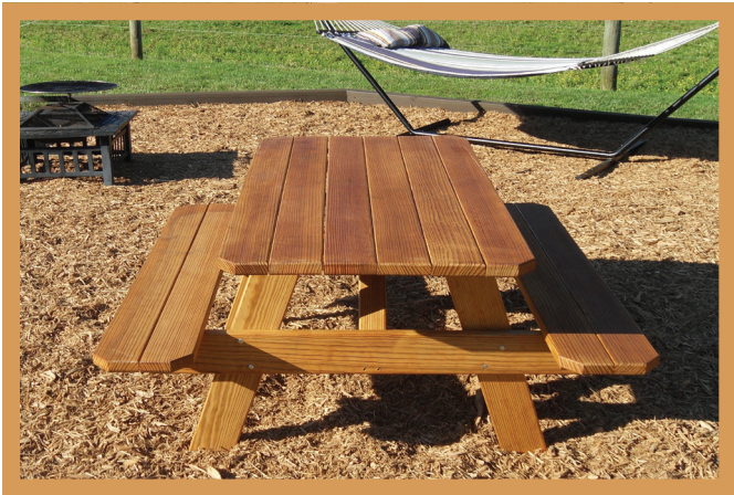
Table shown with natural cedar stain