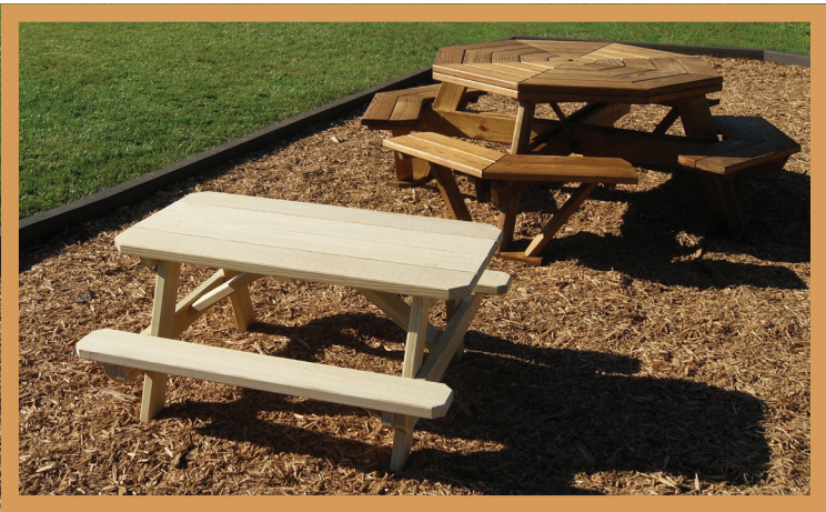
Octagon table shown with canyon brown stain. Child's table in foreground.

52" Octagon Table with Benches Attached 84" x 84" Wide overall with benches