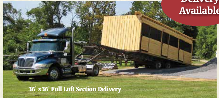
36' x 36' Full Loft Section Delivery