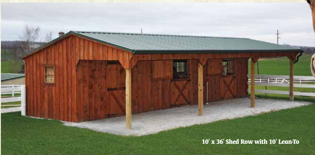
10' x 36' Shed Row with 10' Lean-To