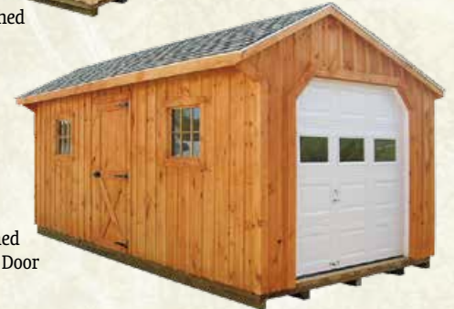
10' x 20' Storage Shed with 7' x 7' Overhead Door