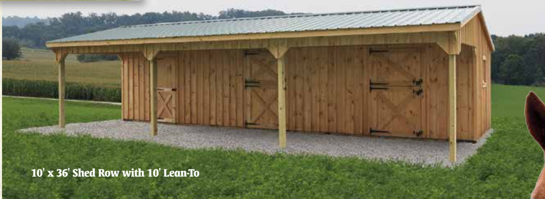
10' x 36' Shed Row with 10' Lean-To