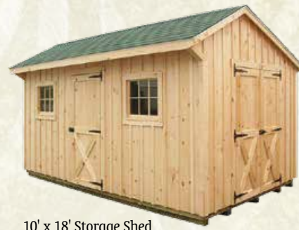
10' x 18' Storage Shed