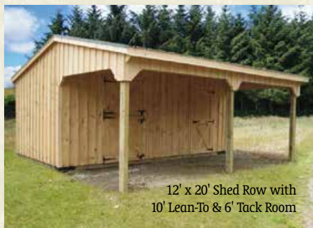
12' x 20' Shed Row with 10' Lean-To & 6' Tack Room