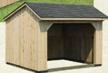
10' x 12' Run In Shed