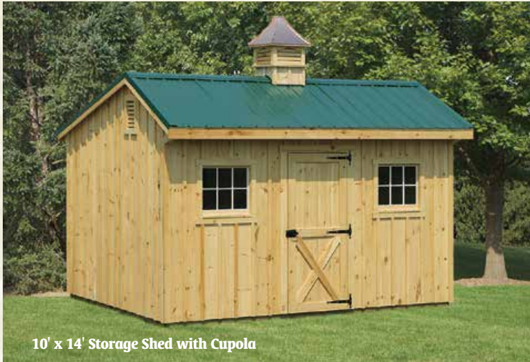
10' x 14' Storage Shed with Cupola