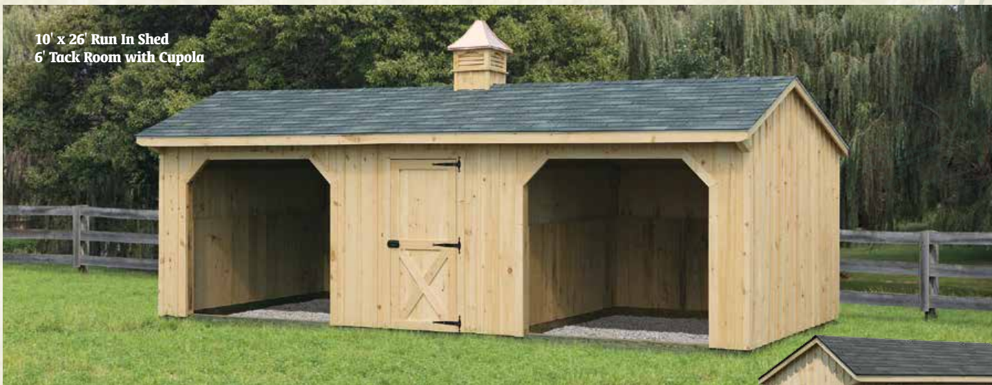
10' x 26' Run In Shed 6' Tack Room with Cupola