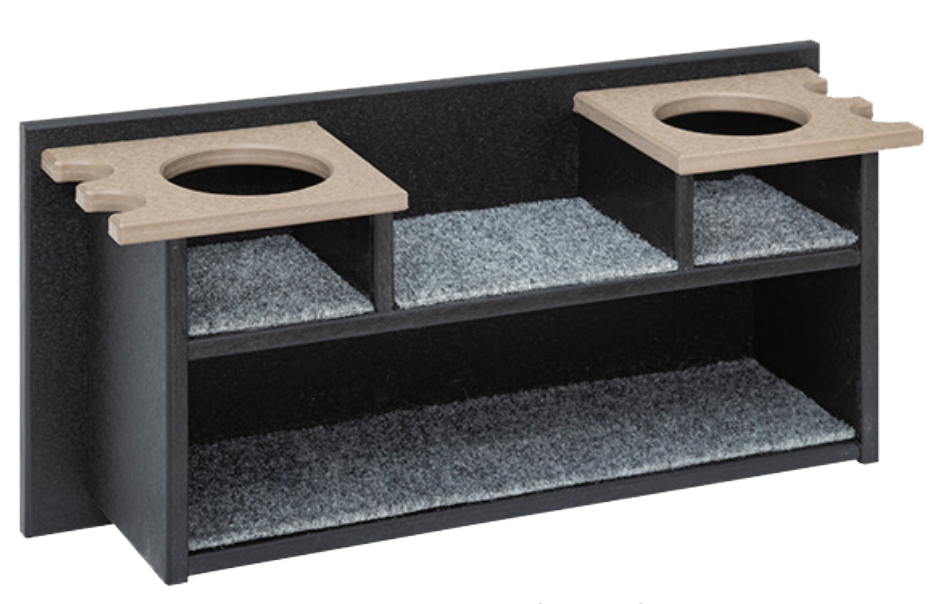
301 Poly Console 23½"w x 7"d x 11¼"h