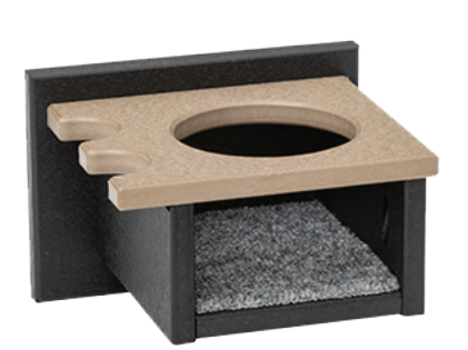
305 Poly Console Mug Holder 8\frac{1}{4} " w x 7" d x 5\frac{3}{4} " h