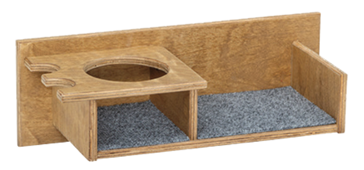
324 Wood Console 17"w x 7"d x 5¾"h