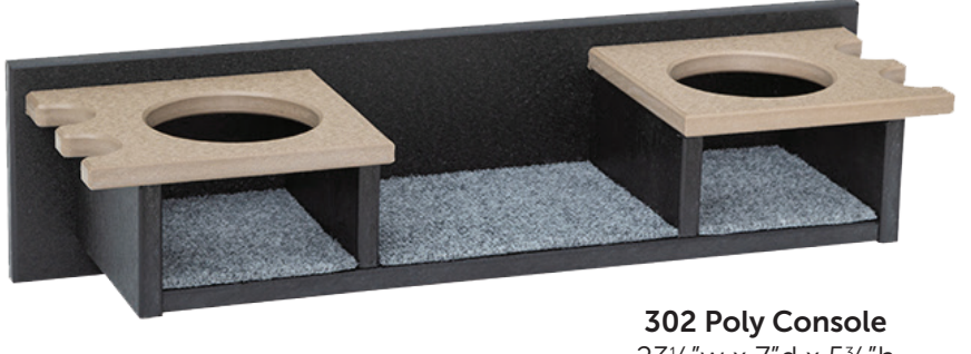
23½"w x 7"d x 5¾"h