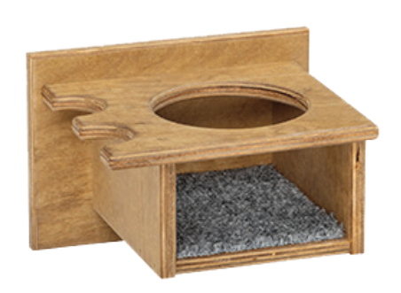
324 Wood Console Mug Holder 8<sup>1</sup>/<sub>4</sub>"w x 7"d x 5<sup>3</sup>/<sub>4</sub>"h