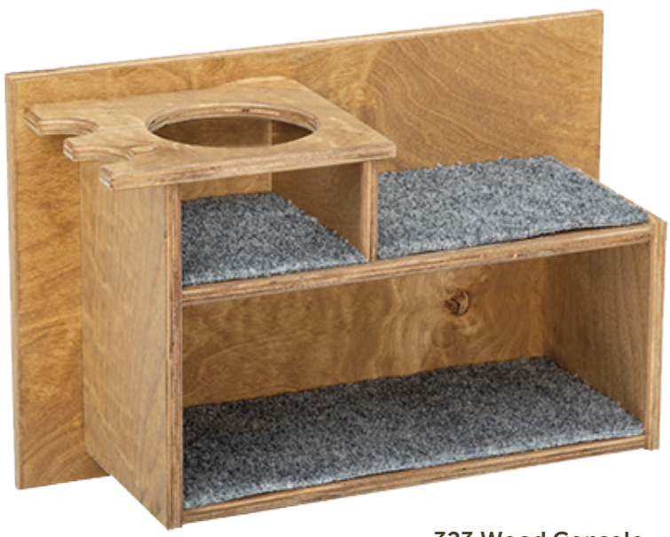
323 Wood Console 17"w x 7"d x 111/4"h