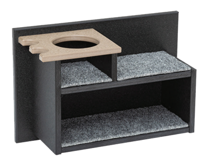
303 Poly Console 17"w x 7"d x 111/4"h